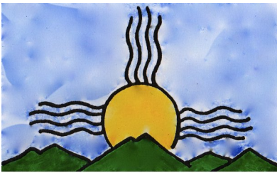
GREEN PARTY OF NEW MEXICO